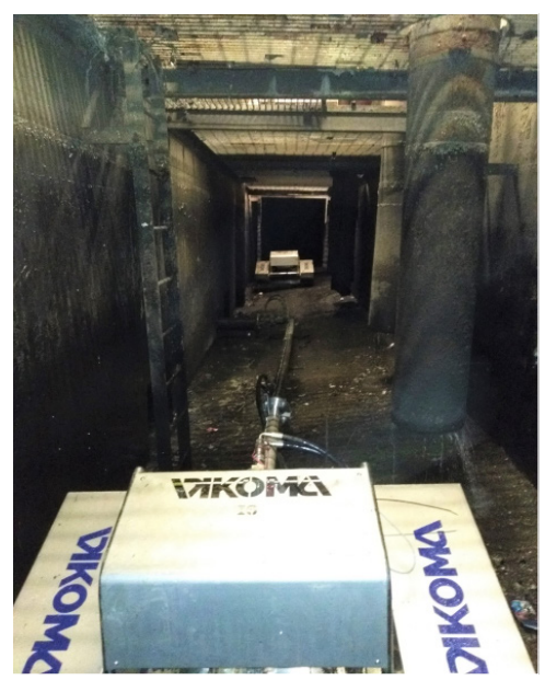
Skimmers in situ in empty sump