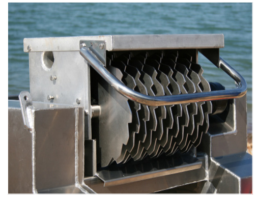
Star disc skimming module

Water injection system for very high viscosity oil. Powerpack also available with electric start, and with additional safety features, spark arrester and automatic overspeed shutdown.