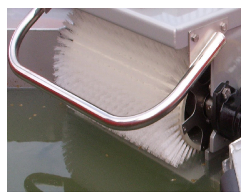
Brush module in skimmer (Maxi version)