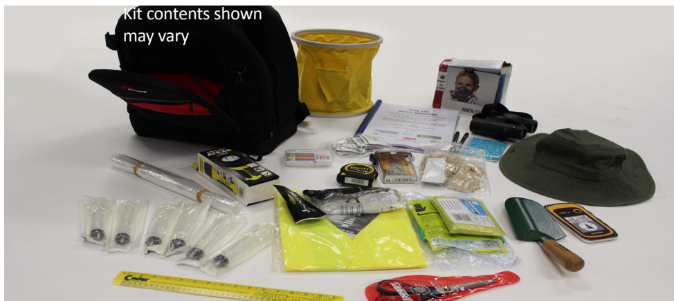
Kit contents shown may vary