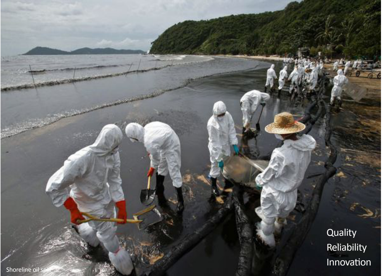
Shoreline oil spill