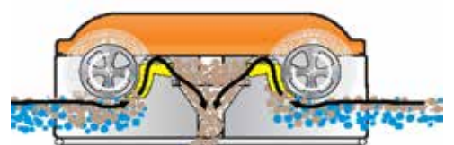
Brush module oil flow