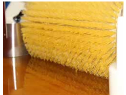
Brush skimming module