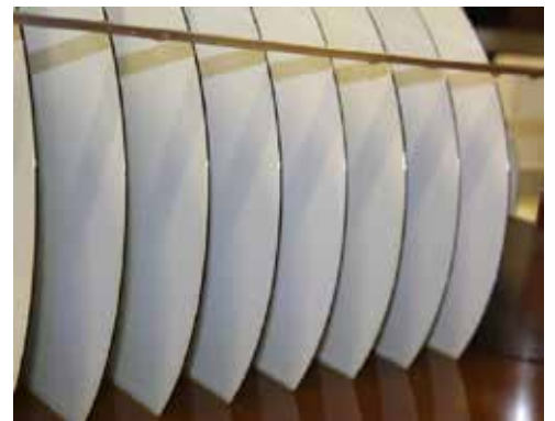
Disc skimming module