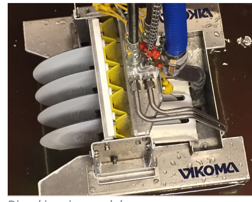
Disc skimming module