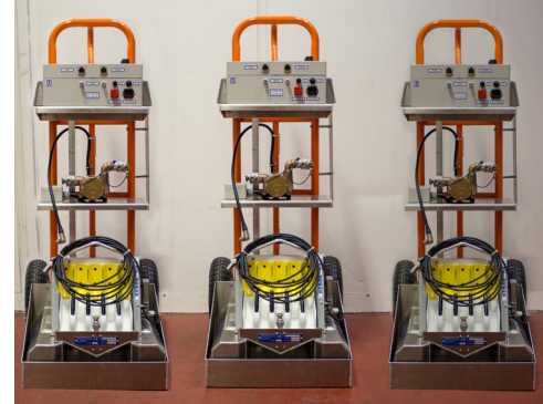
Micro skimmer mounted on trolley