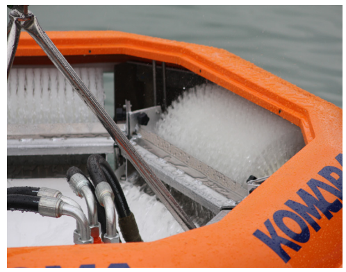
Brush skimming module