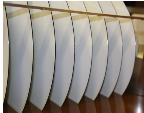
Disc skimming module

Containerised systems available. 1 or 2 systems per 10ft container