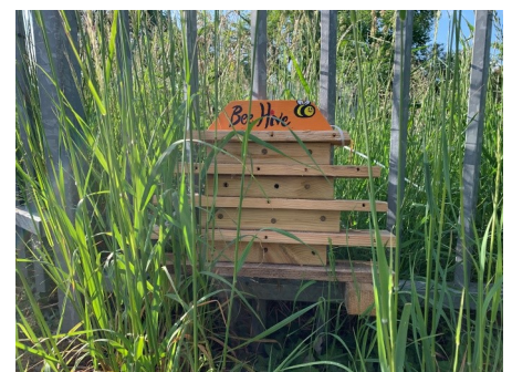
Vikoma Bee Hive Hotel