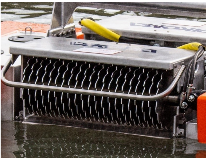
Above: Unique toothed disc module for heavy oils

Star Disc Maxi has also been known as Sea Devil, however we have listened to feedback from customers and it has now been re-named, so thank you to those who have taken the time to give us valuable feedback. We always welcome feedback.