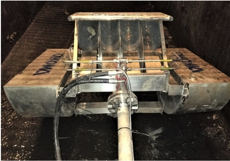
Above: Skimmer in position in sump ready to separate oil from drainage collection